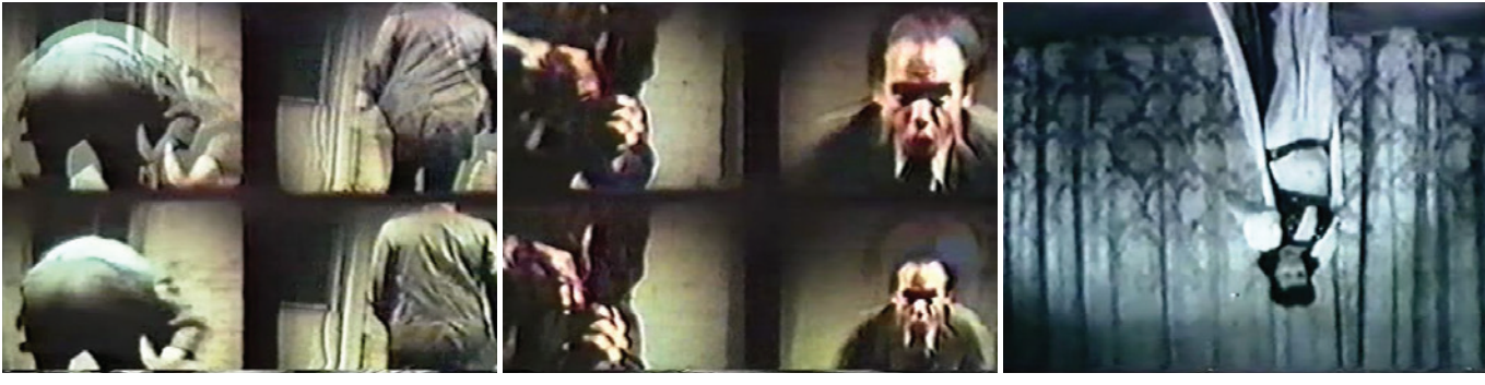
Figure 10. A Tribute to John Cage, Nam June Paik, 1973. End credits. © Estate of Nam June Paik. Used with permission.

After A Tribute to John Cage, Paik shifted toward multimedia art installation projects, and the footage taken from this and other films became part of an overall landscape of technological critique. In the 1974 installation TV Garden, scenes from the film are played on televisions dispersed amid foliage in an art gallery, a literal recycling of cultural by-products in a biomechanical universe. Ironically, by the 1980s many of Paik's innovative ideas found a commercial outlet in the nascent music video industry, and as public support for independent film and video production faded, the meteoric rise of consumer electronics from Japan and Korea elevated Paik's status as the new 'guru' of electronic communications technology in the consumer art industry. The success of guerilla video groups gave rise to the new genre of cable documentary and news programming. Producer Michael Shamburg, who pioneered the independent video reporting