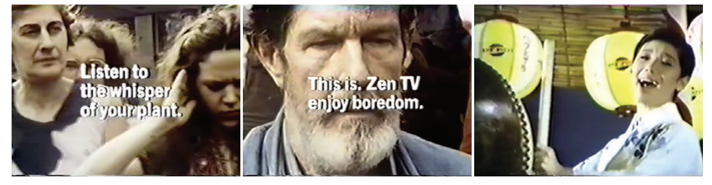
Figure 5. A Tribute to John Cage, Nam June Paik, 1973. John Cage performing 4'33", (left, middle); and on the right cut to Japanese Television Commercial.

Korean and Native American folk music. In this sense, the televisual flow represents not only Williams's notion of a single network's effort to capture a viewer through the seamless integration of content, it gives the effect of a more complex television experience of multichannel 'surfing' through the variety of content available at any time on any given network.