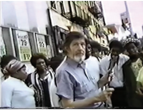
Figure 1. A Tribute to John Cage, Nam June Paik, 1973. John Cage staging a performance of 4'33", 1952, on the Streets of Harlem. © Estate of Nam June Paik. Used with permission.

About two-thirds into Nam June Paik's documentary film, A Tribute to John Cage (1973), we are given a setup in which Paik stages Cage's famous silent piece, 4'33" (1952), in several locations throughout Manhattan. The locations were determined by chance procedures derived from Cage's application of the Chinese oracular I-Ching coin-tossing technique, and for the third movement Cage and Paik found themselves in Harlem on a busy street corner. With buses breezing by, horns honking, and passers-by glancing in curiosity, one would think the chance encounter to be the ideal setting of Cage's most famous statement on environment, acoustics and listening. However, shortly after the introduction of the movement Cage became noticeably flustered, clutching his stopwatch and glancing nervously at a crowd of African-American teenagers casually observing the video camera. Paik seized the moment, grabbing the microphone and asking one the members of the group: