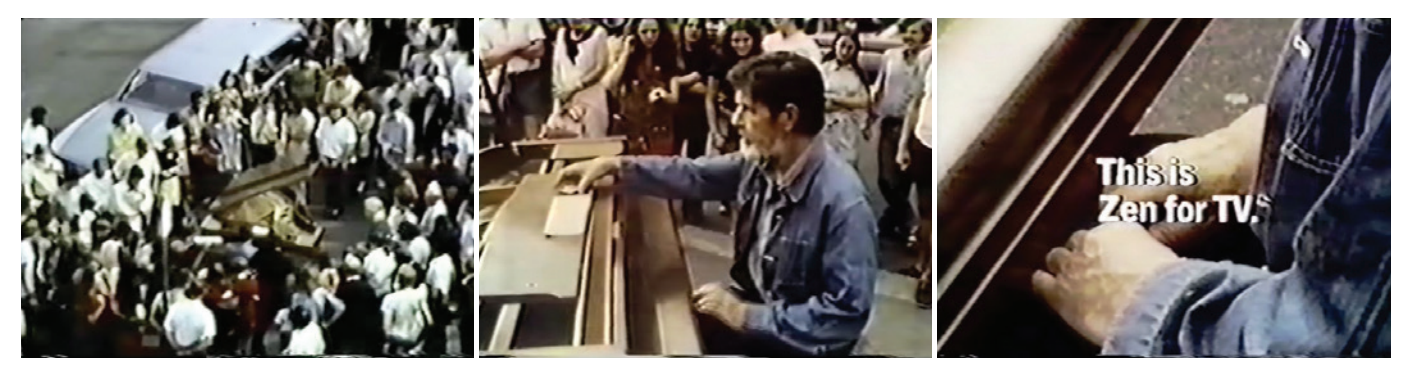
Figure 4. A Tribute to John Cage, Nam June Paik, 1973. John Cage performing 4'33" at Harvard Square. © Estate of Nam June Paik. Used with permission.