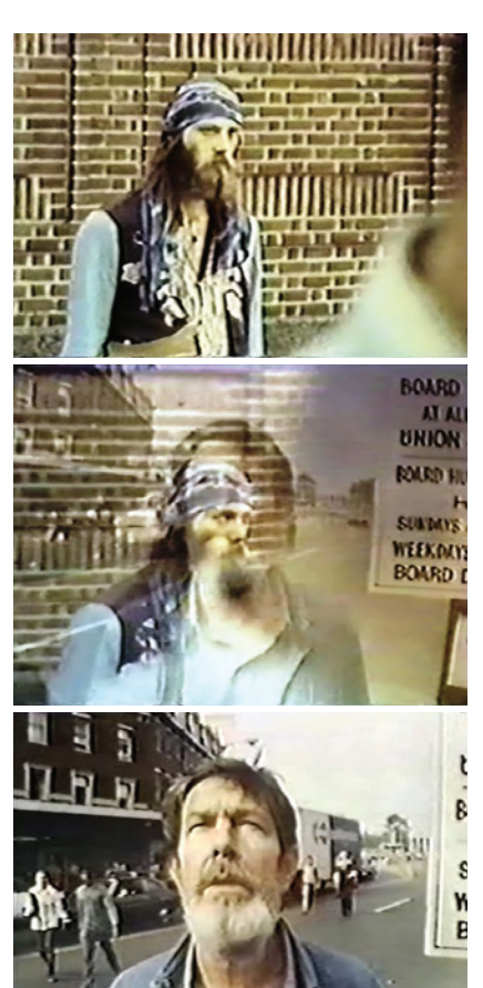
Figure 7. A Tribute to John Cage, Nam June Paik, 1973. John Cage performing from Song Books, 1970, juxtaposed with a passerby at Harvard Square.