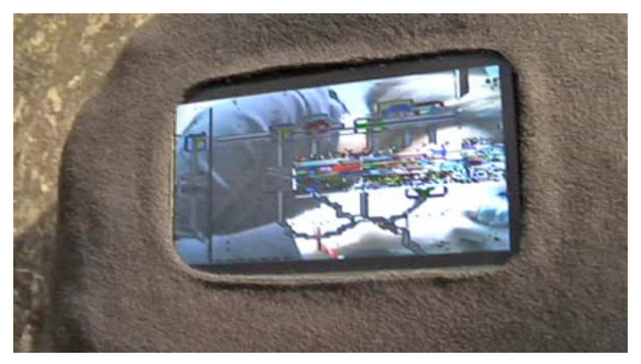
Figure 3. Extagram 1 (detail) by Tanja Vujinovic, soft plush objects, custom electronics (sensor, video monitor, loudspeakers), computer, 6 pieces, variable dimensions, 2007 Copyright © Tanja Vujinovic

The toy-sculpture captures the signal from the space and sends it to a computer, where it is processed and transmitted to the screen of another toy-object.