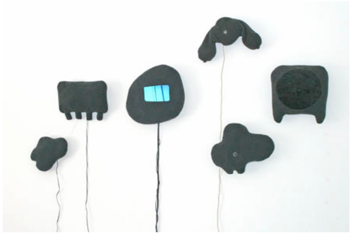
Figure 2. Extagram 1 by Tanja Vujinovic, soft plush objects, custom electronics (sensor, video monitor, loudspeakers), computer, 6 pieces, variable dimensions, 2007 Copyright © Tanja Vujinovic

In Extagram 1, close contact with the user is monitored by means of a real time video system that routes the contact through one of the toys containing a video camera. The toy-sculpture captures the signal from the space and sends it to a computer, where it is processed and transmitted to the screen of another toy-object.